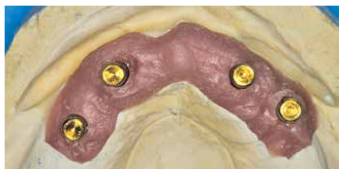
Figure 3: Master model with Locator abutments.