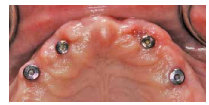
Figure 1: Remove the healing abutments.

Note: A Locator® Core Tool will be required for the next appointment. The torque wrench will be needed for final delivery. If you need Glidewell to provide a torque wrench, please indicate on Rx.