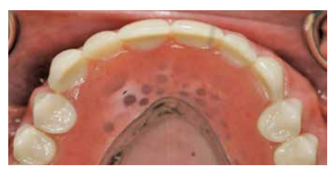
Figure 6: Deliver the final denture.