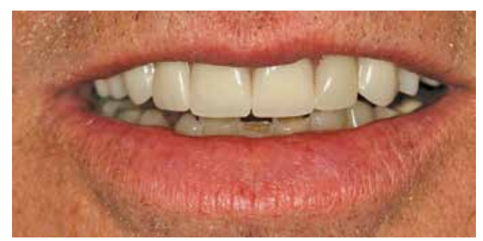
Figure 7: Confirm occlusion.